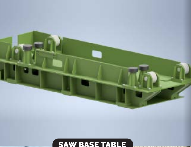
SAW BASE TABLE